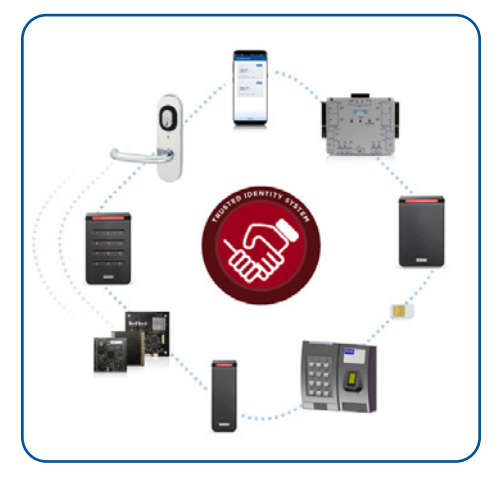
Secure Identity Object Assured Ecosystem